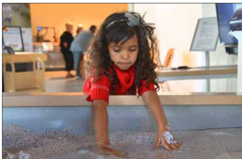
A child plays with the Erosion Table exhibit at the spectrUM Discovery Area.

Partners for CREWS outreach and education activities include UM Broader Impacts Group (BIG) and MSU Academic Technology and Outreach (ATO).