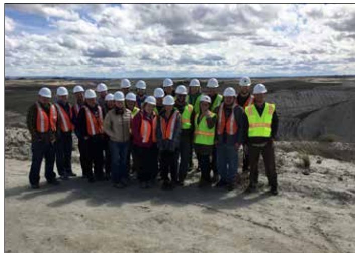
Students in an Energy Resource Geography course participate in a guided tour of the coal extraction process at the West Rosebud Mine.

The Powder River Basin research will ramp up over the five-year project period. The CREWS research team will focus on understanding the impacts of coal mining