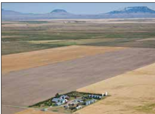
Aerial view of a farm near Stanford.

Due to exceptionally shallow unconfined aquifers and gravelly soils, agricultural activities in the Judith River Watershed over the last century have gradually resulted in high levels of nitrate and low