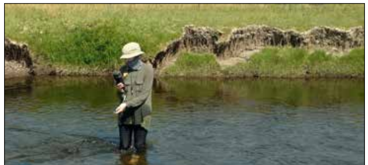
An undergraduate student researcher uses an electrical conductivity probe to measure water quality on the Upper Clark Fork River.

Stay informed through the Montana NSF EPSCoR website ( https://www.mtnsfepscor.org ), project newsletters, and Montana NSF EPSCoR annual meetings.