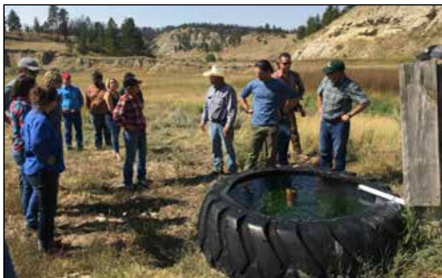
A developed natural spring on a central Montana ranch.