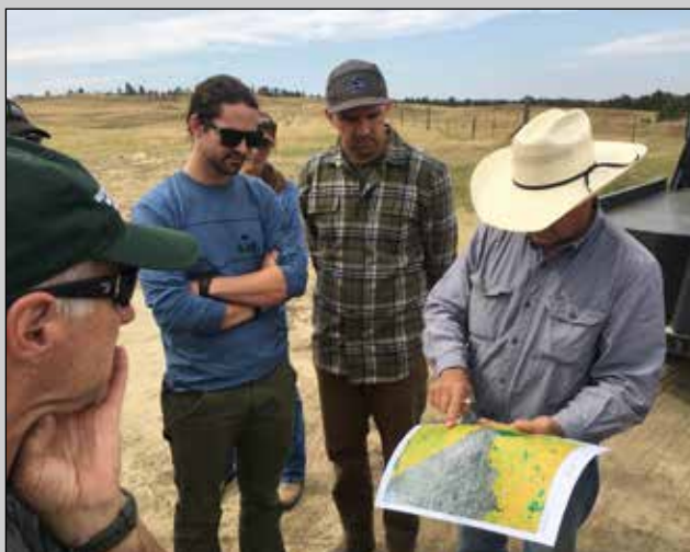
A Montana landowner hosts faculty and graduate students at a restoration project.

CREWS social scientists will study how factors such as social trust and governance processes affect community resilience. Across all the project research sites, CREWS researchers will gather information through focus